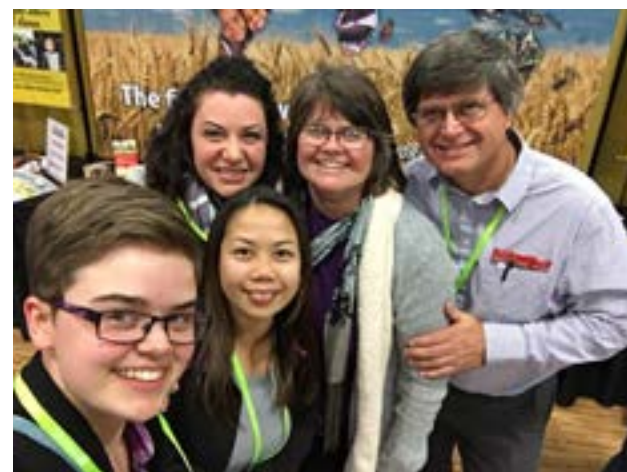
HCC students with local friends at Outreach International.

We would love to count you among those friends.