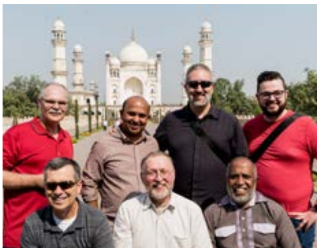
International trip: India.

The Heartland Community is located in the